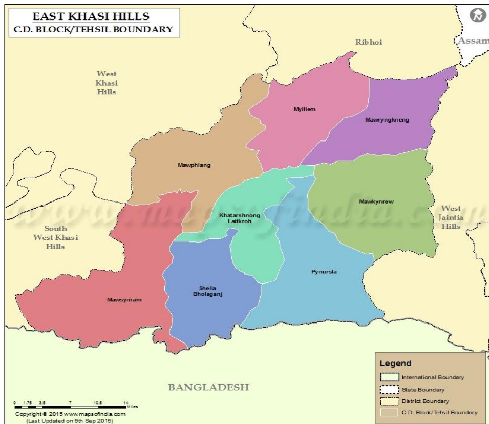
Fig. 2. Map of East Khasi Hills district showing Mawryngkneng block