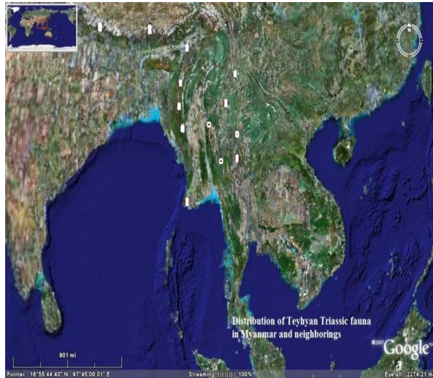
Fig. 4. Showing the relation and correlation between various Monotis species of Triassic in Myanmar, Himalaya and the Indochina

author between terranes in Myanmar and terranes of Tethys domain in Asia to get the estimated paleogeographic position for the Myanmar terranes. Accretionary tectonic provides the additional important constraints for reconstruction of tectonic terranes. More detailed studies of biogeography of accreted terranes in Myanmar are needed for further completion of terranes analysis.