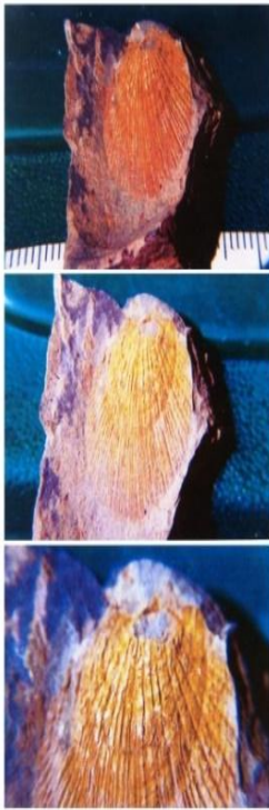
Fig. 3. Photos of Monotis, Dionella