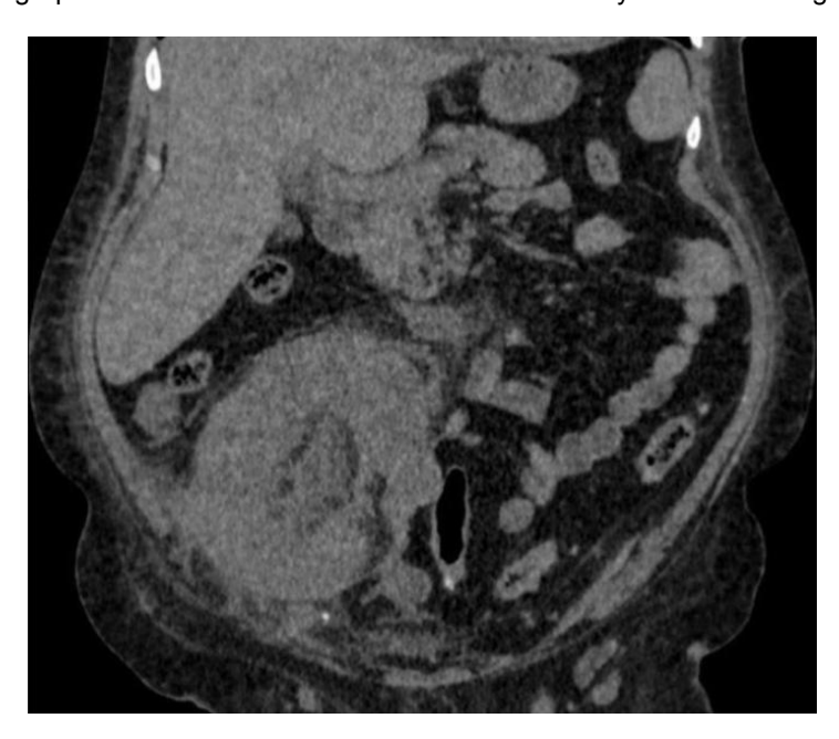
Fig. 1. Computer tomography scan of the abdomen with signs of infection in a transplanted kidney

In April 2019, she presented a feverish condition due to bloodstream infection associated with the catheter. Even with broad-spectrum antibiotic use, the patient progressed with worsening of her clinical status, infection of the transplanted kidney (Fig. 1), and acute heart failure due to endocarditis with a 23% ejection fraction documented by an echocardiogram.