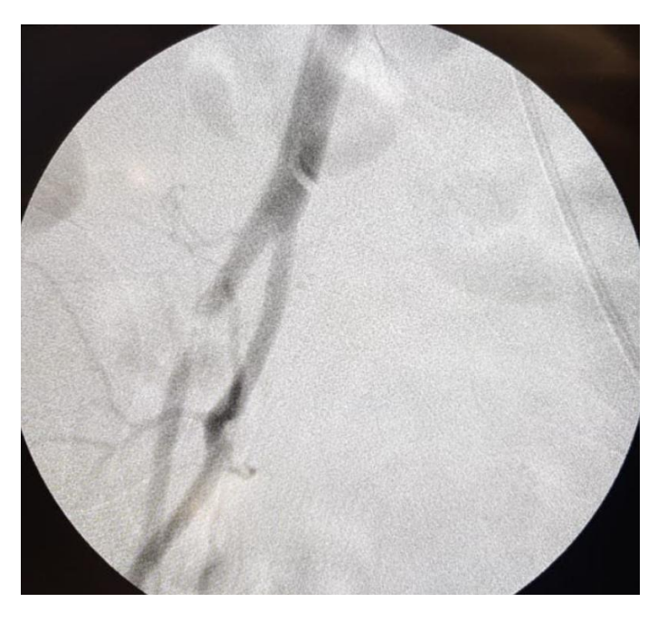
Fig. 3. Fluoroscopy after transplantectomy without signs of bleeding