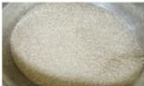
Plate 4. Eggshell