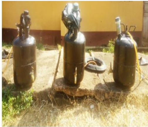
Plate 1. Newly constructed bio-digesters

For this research, there were A: B proportions aimed at investigating the efficiency of stalks of maize in biogas production. The four proportions were as follows: