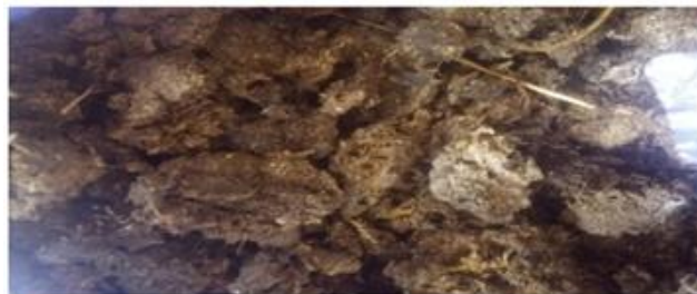
Plate 2. Pig Manure