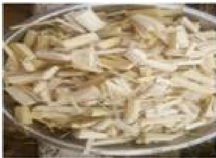
Plate 3. Corn stalk