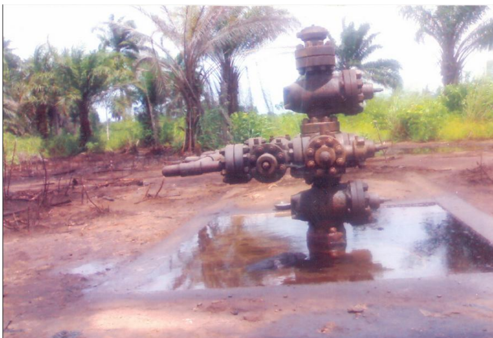
Fig. 2. Well head (Ibibio I) at Ikot Ada Udo Community