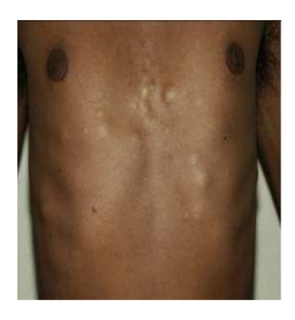
Fig. 1. Chest shows evidence of multiple cysts like lesions

General examination revealed ataxic gait, cachectic dwarfism with height and weight measuring 124 cm, 20 kg respectively & head circumference measuring 20 cm. He was mentally retarded with abnormal speech & low pitched voice. Ophthalmological examination revealed photophobia with optic atrophy. Auditory examination revealed sensorineural hearing loss. Multiple cystic lesions were seen over the chest. (Fig. 1).