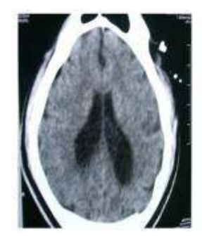
Fig. 6. Axial computed tomography of skull