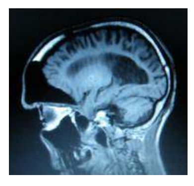
Fig. 7. Magenetic resonanace T2 weighed image