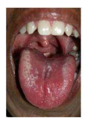
Fig. 3. Intra oral examination