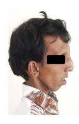
Fig. 2. Lateral profile of face

OPG showed multiple dental caries, multiple root stumps with increased caries activity, relative micro-dontia and slight increase in the density of mandible (Fig. 4). Lateral skull radiograph revealed micro-cephaly, small orbits with increase in the gonial angles and marked density of calvarium. Postero anterior skull views show obliterated paranasal sinuses. Plain X-ray of the chest showed decrease in the total length of spine and thoracic kyphosis (Fig. 5).