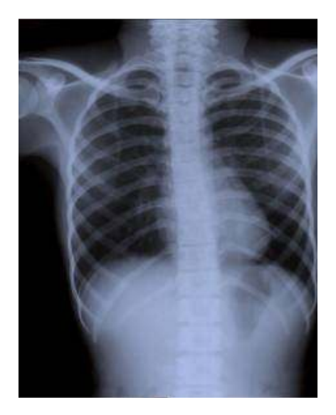
Fig. 5. Plain X-ray of the chest