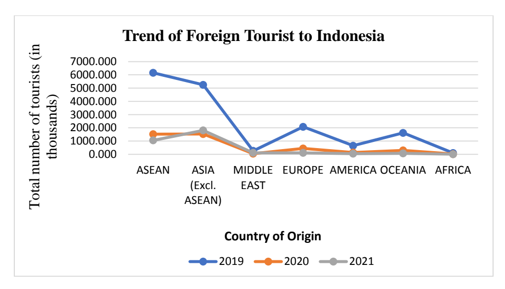
Fig. 1. Graphic of foreign tourist in Indonesia

depicts Fig. the trend of foreign Indonesia tourists to as а decreasing linear line from 2019 to 2021. It can also be seen that the majority of foreign tourists visiting Indonesia come from ASEAN, Asia, and Europe countries, as they outnumber other countries. Meanwhile, African tourists are the fewest.