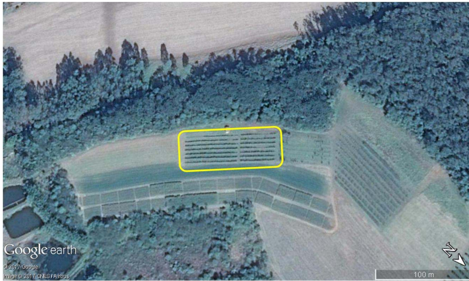
Fig. 1. Map showing the Germplasm Bank of stone fruits. Capão Bonito, SP, Brazil

hot summer, according to the Köppen classification). Annually, the municipality of Capão Bonito has approximately 100 hours of cold (temperature below 7.2°C) and an average rainfall of 1,236 mm [2].