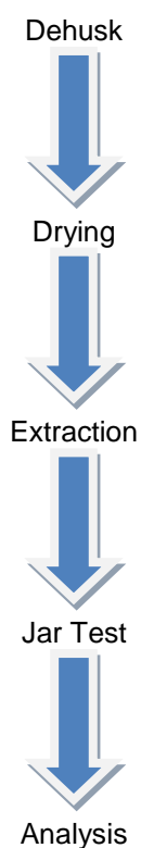
Fig. 1. Flow chart of water treatment method for Diospyros mespiliformis seed Adapted from [7]