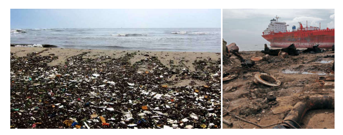
Fig. 6. Pollution associated with the plastic warehouses, Black Sea coastal area [2]

Cioruța and Coman; AJGR, 3(4): 46-55, 2020; Article no.AJGR.58391