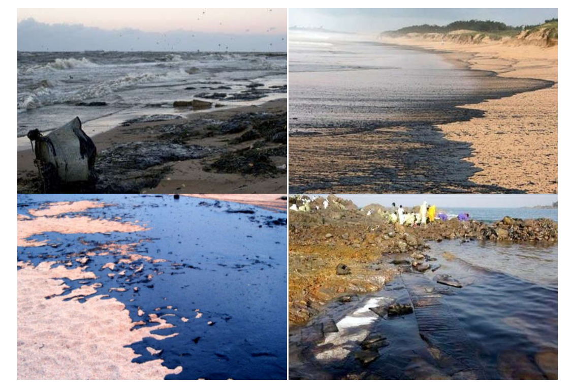
Fig. 5. Pollution associated with the discharges of petroleum products [18-21]

example, foreign objects were found in the stomachs of some common porpoises and failed dolphins.