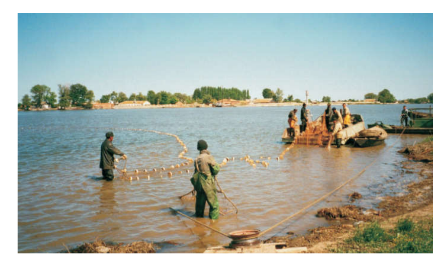
Fig. 7. Group of fishermen from the Russian Black Sea coast

in the Black Sea is the dolphins or large aquariums on the coasts. Exotic marine mammals from these places are kept in outdoor shelters near the shore, and from here, sometimes escape into the sea.