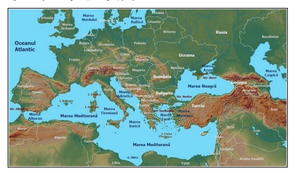
Fig. 1. Black Sea Basin and its connection with other seas [7]

The Black Sea is connected to land by the Danube River which is considered the main