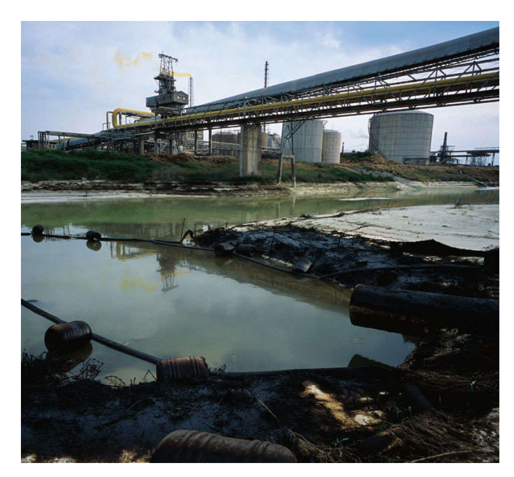
Fig. 3. Pollution associated with the persistent organic pollutants, near Danube [2]

Cioruța and Coman; AJGR, 3(4): 46-55, 2020; Article no.AJGR.58391