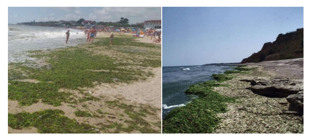
Fig. 4. Pollution associated with the eutrophication phenomenon [16]

Cioruța and Coman; AJGR, 3(4): 46-55, 2020; Article no.AJGR.58391