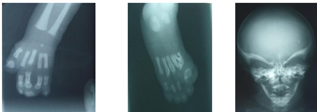
Fig. 2. X-ray report

One-month-old infant, only child, from non-consanguineous parents and a vaginal delivery. He presents with a polymalformative syndrome comprising brachycephaly, facial dysmorphism associating flattening of the root of the nose, hypertelorism and bilateral exophthalmos. She presents syndactyly of all four limbs. X-rays of the hands showed synostosis of the distal phalanges and that of the skull a reduction in anteroposterior dimensions, coronal synostosis and digitiform impressions. Brain CT showed ventricular dilatation, cerebral edema and cortical atrophy.