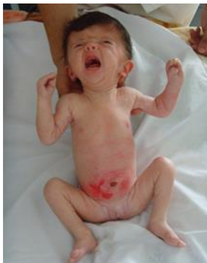
Fig. 1. Picture of 3-month-old infant

3-month-old infant, third of 3 siblings, from non-consanguineous parents, an unmonitored pregnancy and a vaginal birth. She presents a polymalformative syndrome with excessive height of the skull, facial dysmorphism with hypertelorism, bilateral exophthalmos, an ogival palate and syndactyly affecting all four limbs.