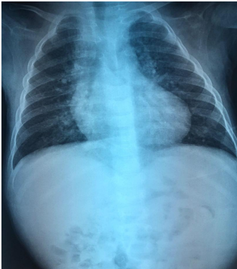
Fig. 3. Chest X-ray of the child