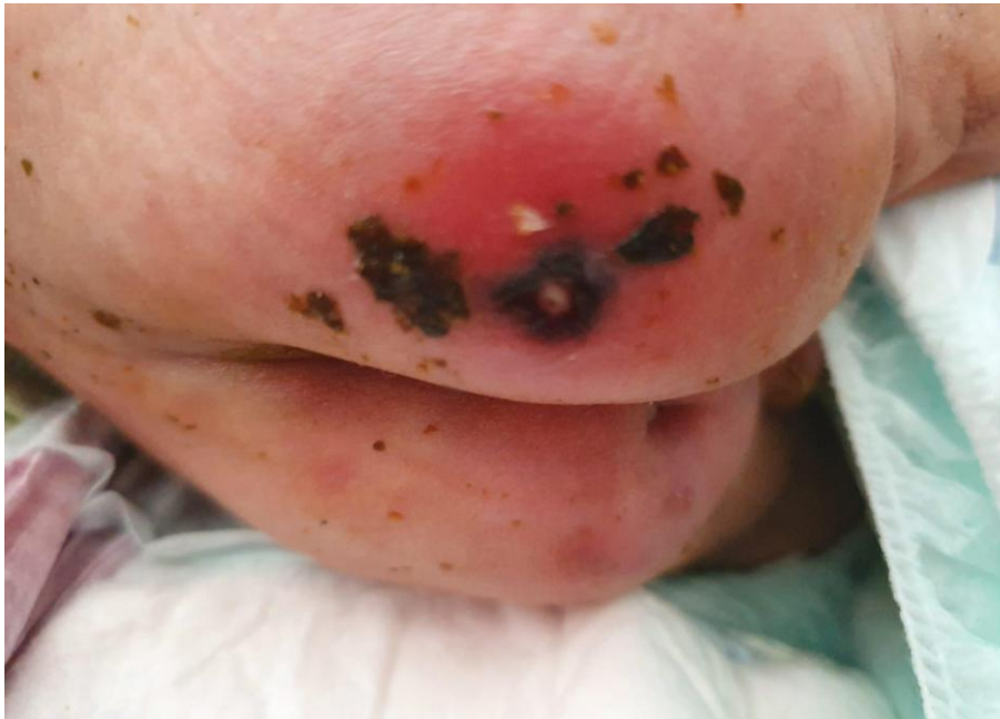
Fig. 2. Image of a gluteal abscess