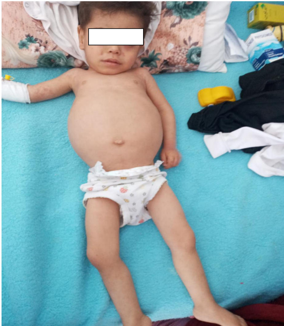
Fig. 1. Image of the child with hyperIgE syndrome

In our patient's case, we can say that it is a recessive type due to the absence of a similar case in the family, the presence of allergic manifestations such as eczema, and the association with an autoimmune disease such as celiac disease. However, due to a lack of funds, the genetic study could not be carried out [16,17].