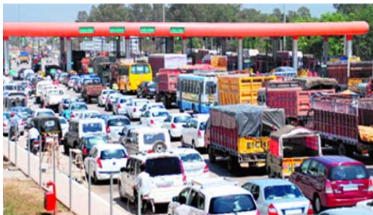
Figure 3. Electronic Toll Collection in India.

4) Active Prediction : It anticipates the upcoming topography of the road, which is expected to optimize fuel usage by adjusting the cruising speed before starting a descent or an ascent. Secondly, the driver is also assisted [10].