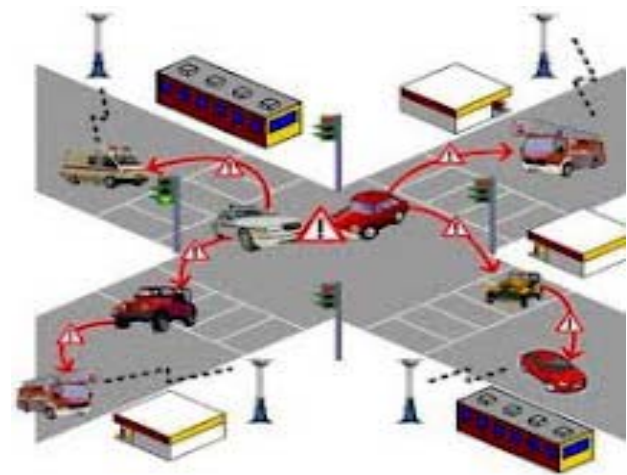
Figure 2. Emergency situation Notification.

2) Internet Access : Vehicles can access internet through RSU if RSU is working as a router.