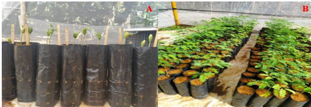
Fig. 2. Seedling emergence assessment (A), Monitoring seedling growth for emergence speed index calculations (B)