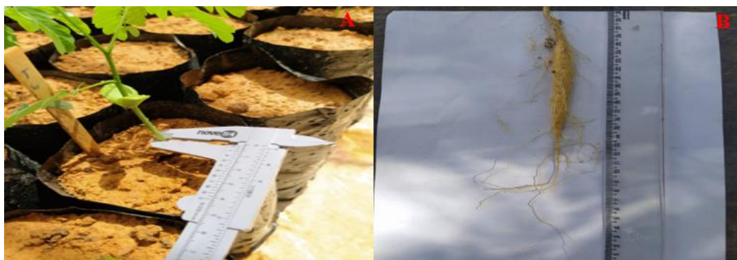
Fig. 4. Evaluation of seedling stem diameter (A) and length of the root seedling system (B)