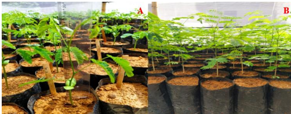
Fig. 3. Plant height assessment (A) and the number of leaves seedling (B)