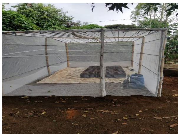
Fig. 1. Experimental area for seedling cultivation

The seeds were acquired in the Nursery Seed of Brazil. Soil (dystrophic Red Latosol) was used for the substrate composition. Seeds underwent different forms of scarification (Table 1).