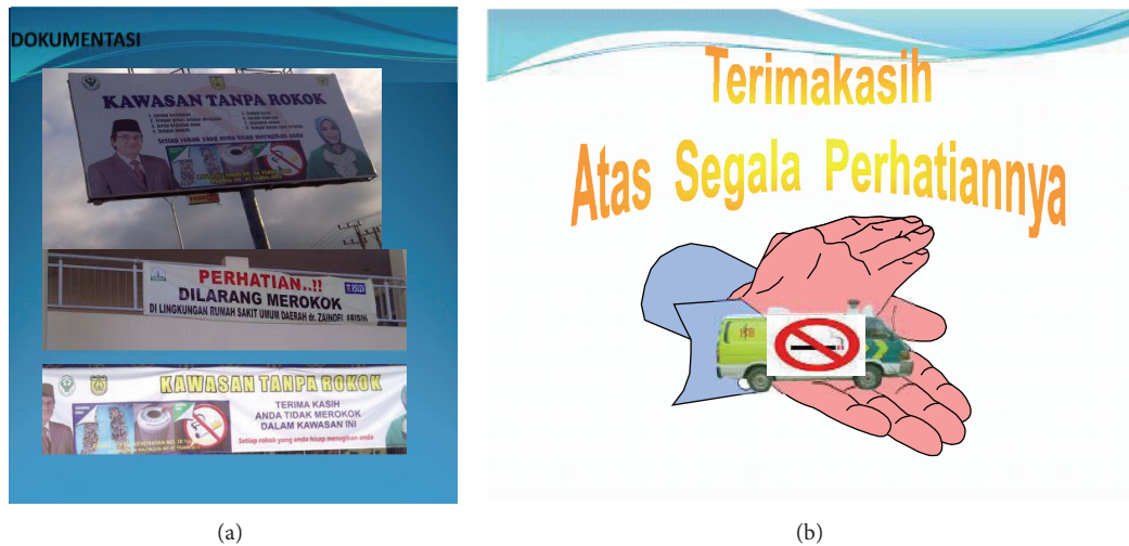
FIGURE 4: (a) Left above: example of freestanding “No Smoking Area” sign erected outside. Centre: example of No Smoking wall poster. Below: example of “No Smoking Area” wall sign. (b) Above: Thank You for Your Attention with no smoking sign used in slide presentations.

in the hospital and its grounds, so that the hospital areas are completely free from cigarette smoke;