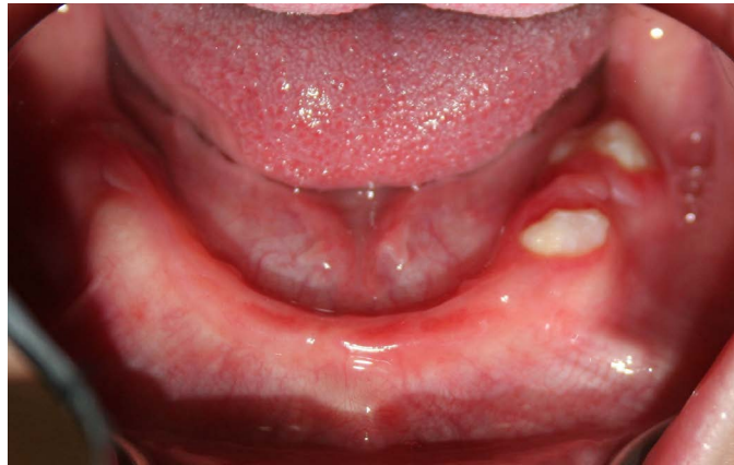
Figure 6. Mandibular occlusal view.

dentistry hospital with complaints about her early permanent teeth growth and problems about looseness and bleeding during brushing and eating. All her teeth were removed at age 7. Internal oral examination showed loss of the remaining ridge and imbalance of maxilla and mandible ridges that this loss was clear even for unerupted teeth in alveolar generalized loss radiography inspections. In order to determine the maintainable teeth, a pre-epical radiography was performed on this patient. In medical inspections, there was found no sign of systemic problem. Parents of the patient didn't have any clear historical problem but they had a familial marriage. Mother was physically and psychologically, normal only had problems of gum destruction at mandibular anterior region with calculus signs in the region. There were no sign of skin infection, ear infection, liver or pneumonia in the history of the family. Laboratory tests including complete blood count, alkaline phosphatase, and abnormal liver enzymes in which no abnormal sign was observed. In external oral inspections, there were evidences of hyperkeratosis of palms and soles clearly ( Figure 7 and Figure 8 ).