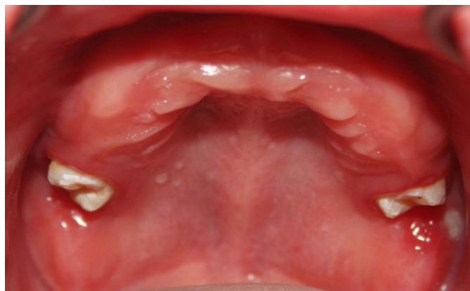
Figure 5. Maxillary occlusal view.

At the time of referring to the hospital, patient's remaining teeth included mandibular left first and second premolars and first premolar both at maxilla side ( Figure 5 and Figure 6 ).