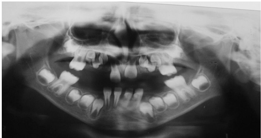
Figure 4. Panoramic radiography at age 6.