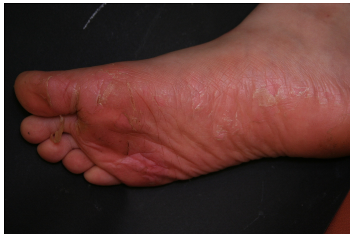
Figure 8. Hyperkeratosis of soles.