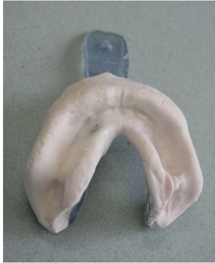
Figure 10. Primary mandibular template.