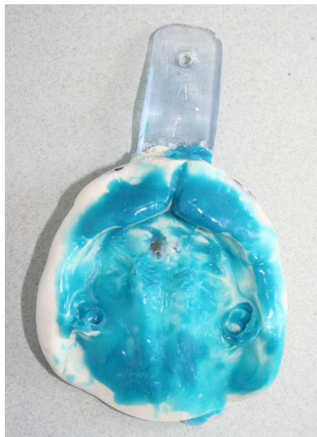
Figure 9. Primary maxilla template.