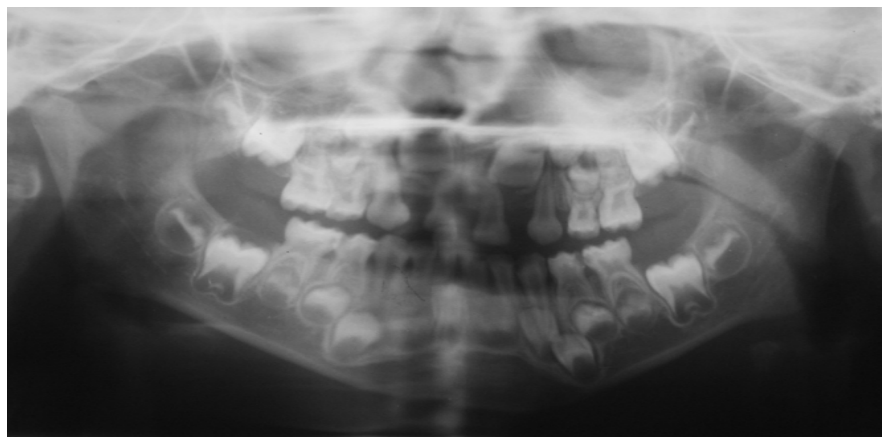
Figure 2. Panoramic radiography at age 4.