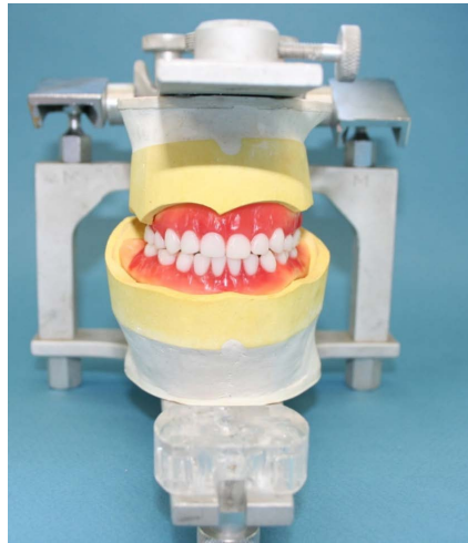
Figure 11. Arranged teeth.