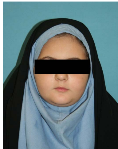
Figure 1. A little 8-year old girl.

A little 8-year old girl ( Figure 1 ) with early complaints of looseness of permanent teeth soon after their eruption with full Edentulous referred to Dentistry department of Tehran University. Panoramic radiography of ages 4, 5, 6, 7 of the patient was available ( Figures 2-5 ). The patient underwent follow-up process and teeth with acute periodontal problems were removed from her mouth.