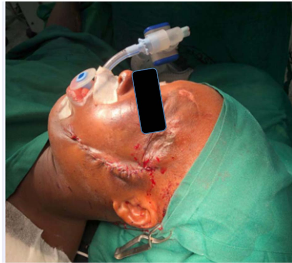
Figure 3. Flap rotated into place and secured.