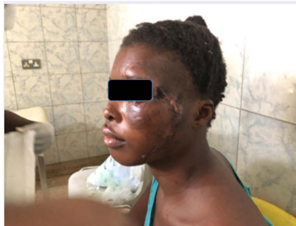
Figure 4. Patient post-operative day 10.