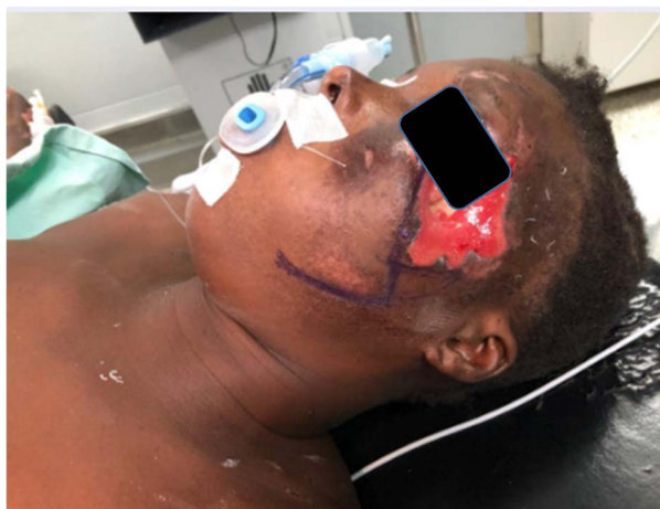
Figure 2. Facial defect with zygomatic bone exposed. Pre-operative Rotational flap markings made.

The post-operative period was uneventful. Her wounds healed well. She suffered no facial nerve injury. This option resulted in a good colour match with no disruption of facial contour ( Figure 4 ).