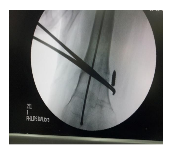
Fig. 4. C ARM image showing a bent artery forceps from lateral side to remove the medial broken tip of the screw