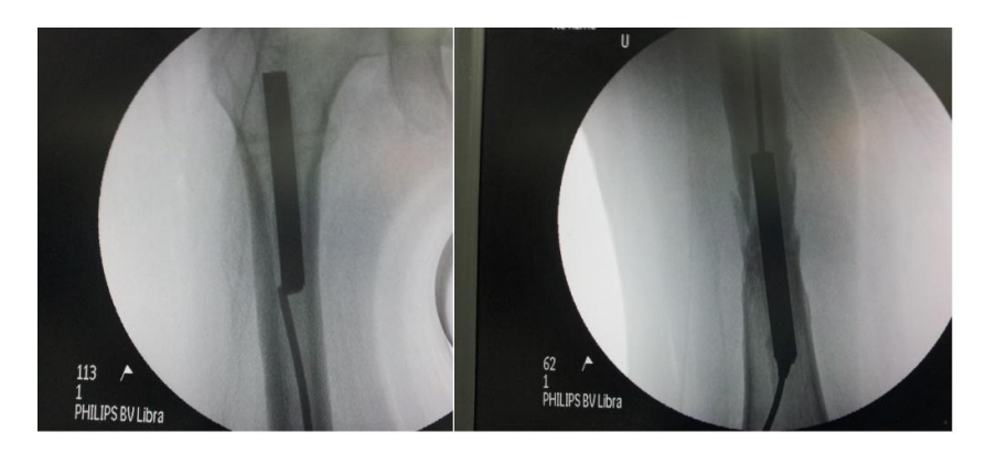
Fig. 2. The image intensifier picture showing the proximal fragment of the three-part broken femoral nail removed using the extraction jig. The middle portion of the broken nail with a guide wire passed inside from proximal end and the ball tipped guide wire in the distal portion