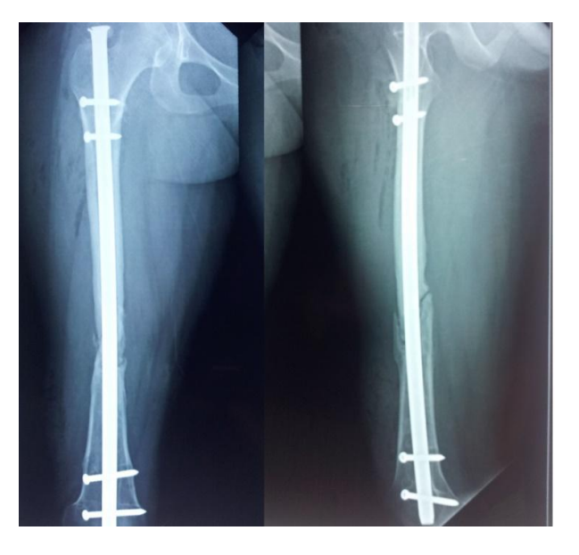
Fig. 5. Final check radiograph showing a longer nail placed such that both the distal locking bolts are beyond the cortical window