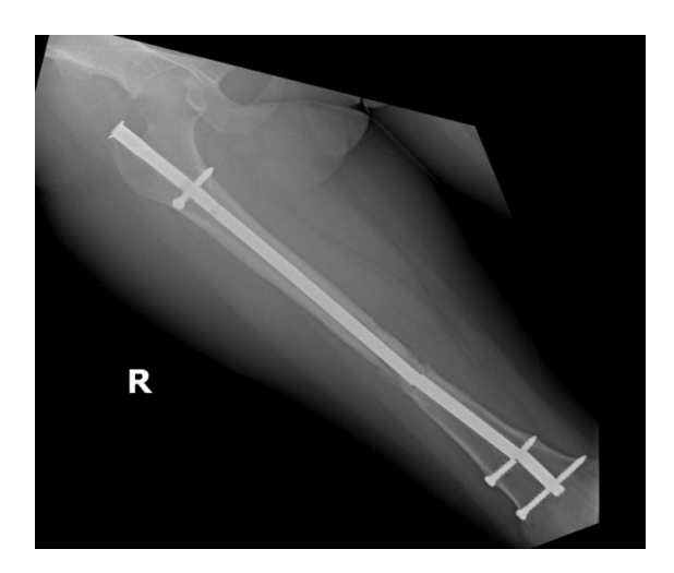
Fig. 1. The plain radiograph showing the three-part broken femoral nail with delayed union of fracture