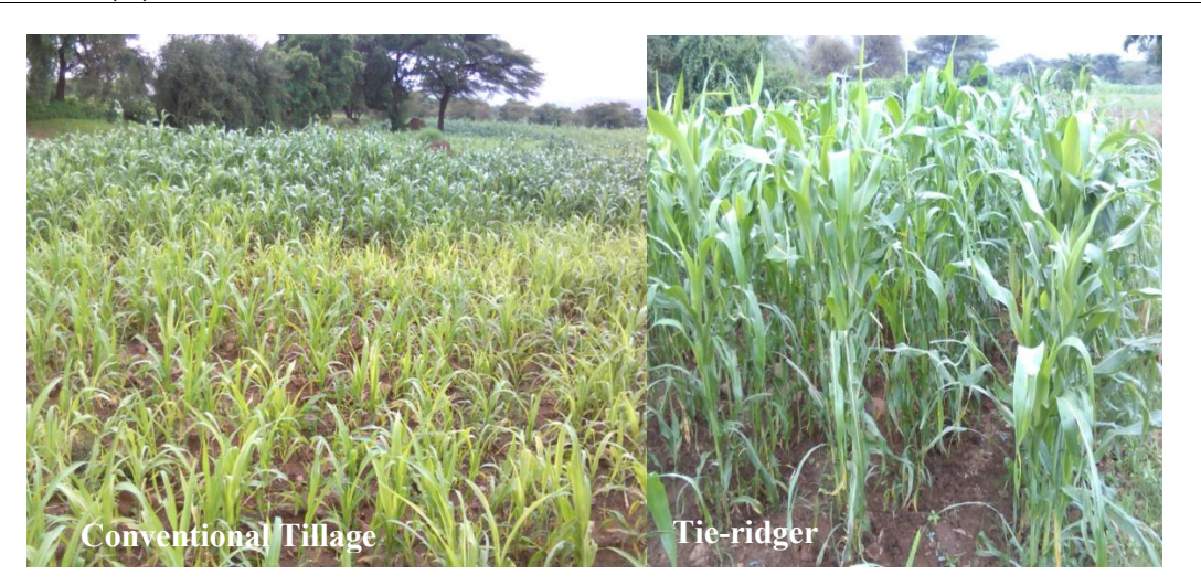
Fig. 2. Some representative photos of the conventional tillage and conservation agriculture practices at tabia sheka tekli

how to improve farmer awareness of CF benefits and how efficiently incorporate green manure and cover crops.