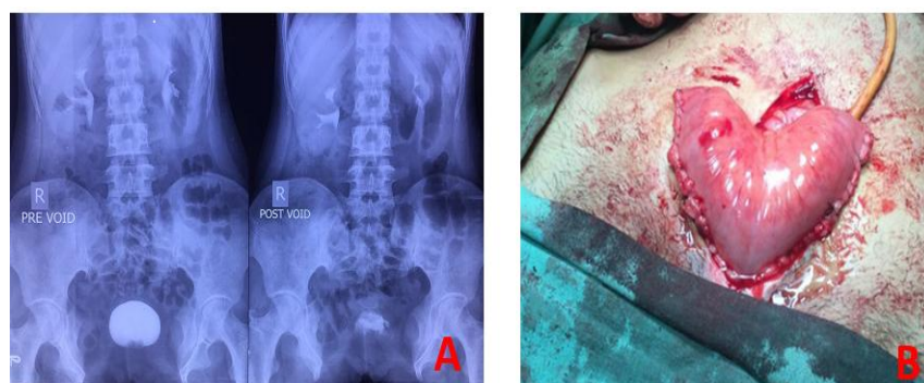
Fig. 2. A) IVU showing no hydronephrosis, bladder capacity approximately 100 cc and insignificant post void residual urine. B) ileocystoplasty