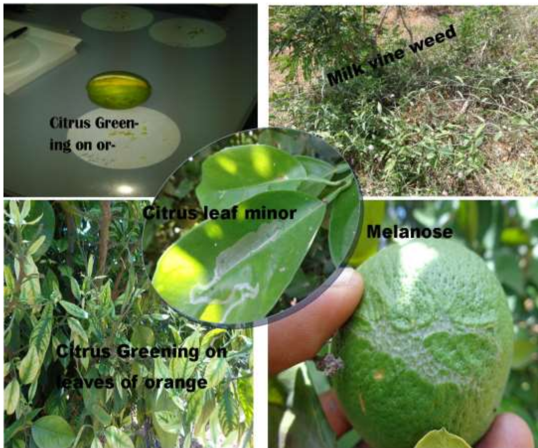
Figure 2. The image of citrus attacked by fungal, bacterial and vine weed at Adiha and Sheka Tekli irrigation scheme.

Ethiopia in 2016. Hence, the presence of the disease and the natural vector may lead to rapid spread of the diseases to many parts of Ethiopia including Adiha and Sheka Tekli citrus orchards. Citrus leaves infected with citrus greening showed a characteristic symptom of blotchy mottled and yellowing discolorations (Figure 2). In addition, the leaves were found to be narrowly structured and they did have a bunchy appearance. Severely infested citrus trees at Adiha and Sheka Tekli irrigation schemes ultimately remained as leafless twigs and dieback.