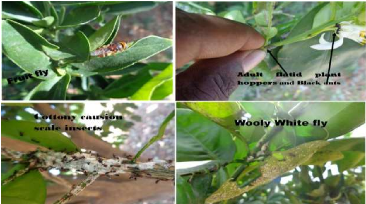
Figure 3. The image of citrus attacked by major insect pests at Adiha and Sheka Tekli irrigation scheme.