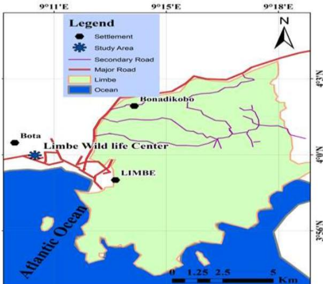
Fig. 1. Map of Limbe city showing the settlement and study area adapted from Melle Ekane Maurice [12]