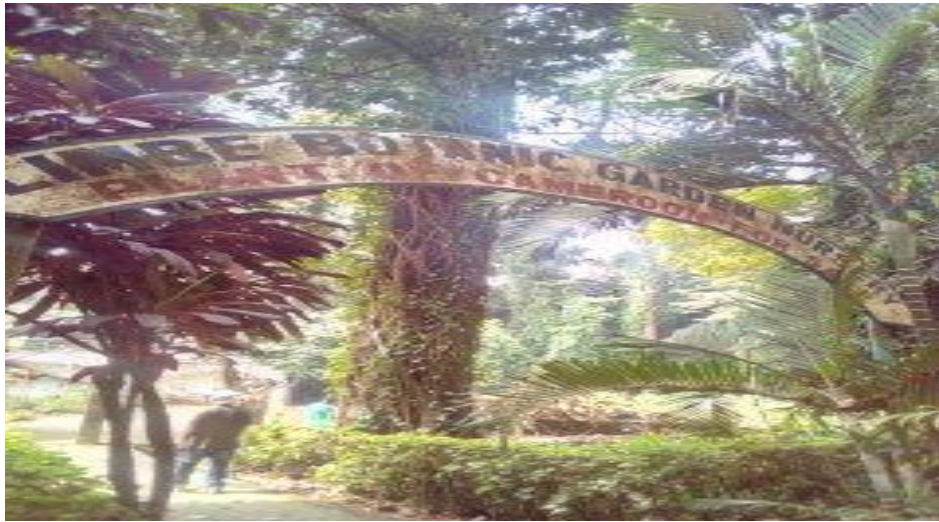
Fig. 2. The nature of the nursery structure of the Limbe Botanic Garden