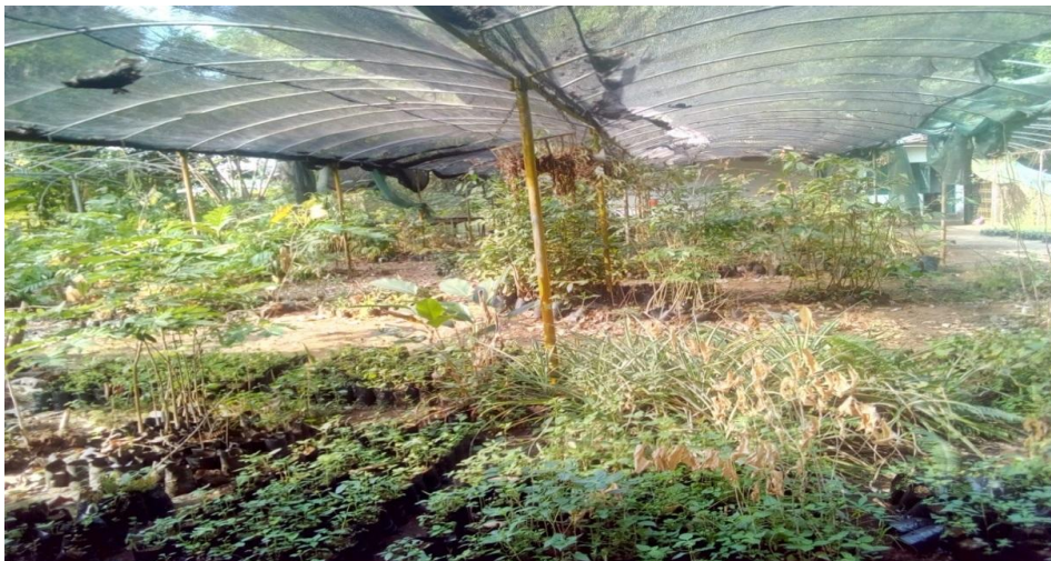
Fig. 3. Over grown seedlings that need to be transplanted in the Limbe Botanic Garden