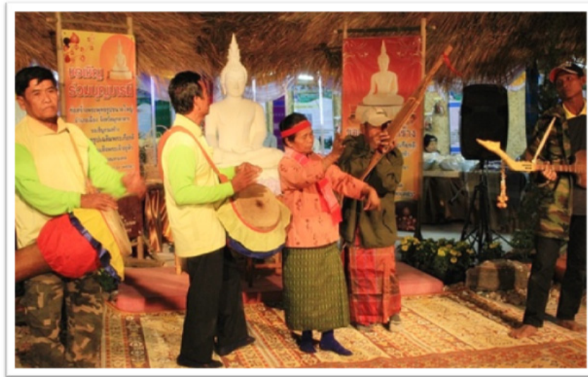
Figure 2. The Yao Ceremony of Mukdahan Province

pavilion and the site is colorfully decorated with flags or fabrics to indicate the ceremonial importance of the stage (Figure 2).