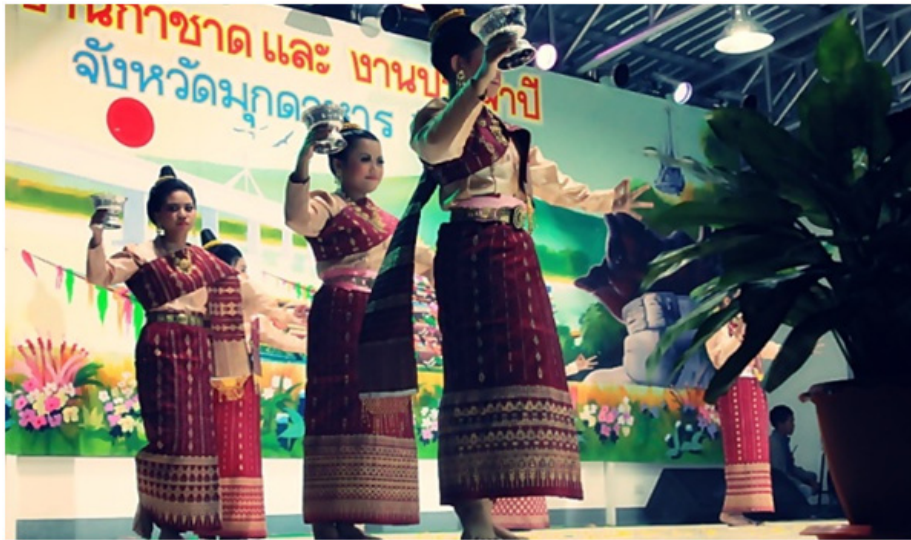
Figure 4. Results of choreography teaching to upper secondary level students in Mukdahan Province