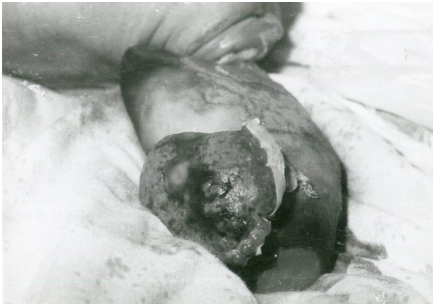
Fig. 1. Macroscopic view of the sacrococcygeal mass

A three – day – old baby girl was referred to our hospital due to a sacrococcygeal mass which looks to a lower extremity (Fig. 1).