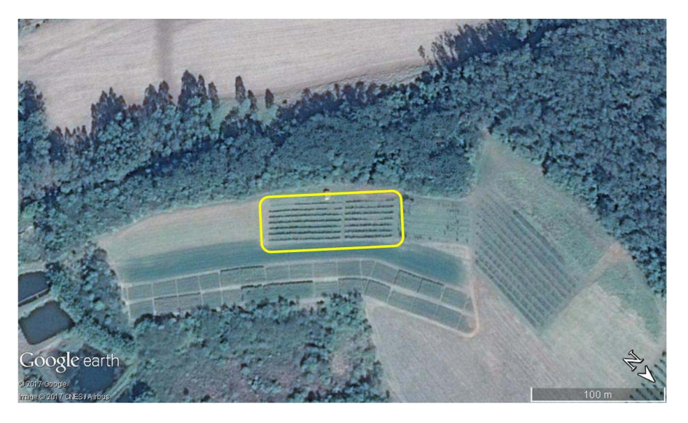
Fig. 1. Map showing the Germplasm Bank of stone fruits. Capão Bonito, SP, Brazil

hot summer, according to the Köppen classification). Annually, the municipality of Capão Bonito has approximately 100 hours of cold (temperature below 7.2°C) and an average rainfall of 1,236 mm [2].