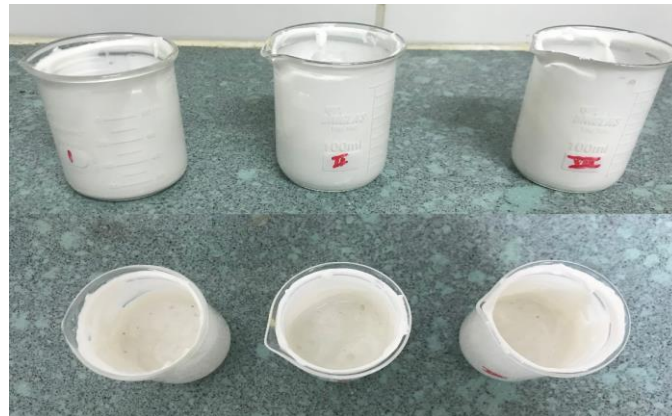
Fig. 1. BRP dentifrices after 60 days of production

verified the samples in the periods of 0, 15, 30, 60 and 90 days, and they remained stable. Other studies with natural products also showed stability for up to 90 days, such as the one by Leite [24] in a dentifrice by Ricinus Communis and Valones et al., [25] in a Rosmarinus officinalis Linn toothpaste.