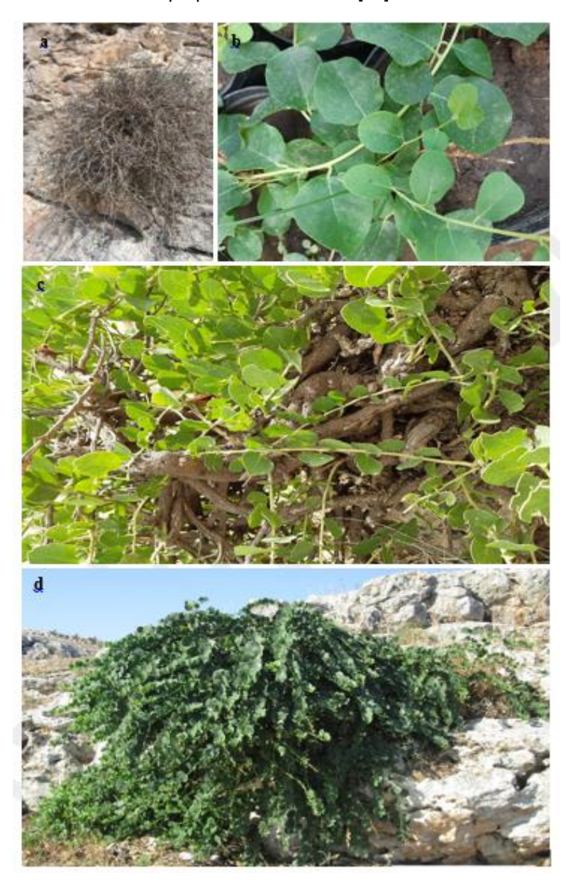
Fig. 1. (a) Adult caper shrub in vegetative rest ; (b) new leaves ; (c) branched stems and (d) adult caper shrub in vegetative stage

Concerning the flowers, they are of purplish blue color and are clearly bilabiated. The posterior lip being very developed that the inferior lip [18]. Caper flowers are exceptionally beautiful but ephemeral (Fig. 2). They bloom at the end of the afternoon and wither during the following morning. The caper is an allogamous plant with entomophilic pollination provided mainly by moths [21].