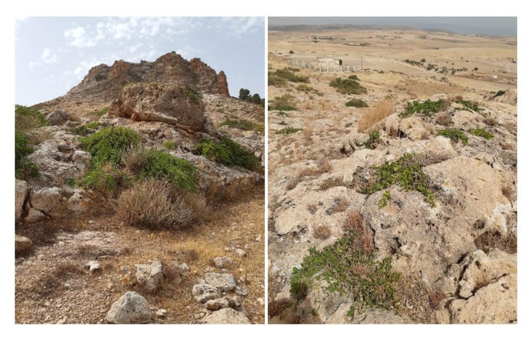
Fig. 3. Adaptation of Capparis spinosa var. inermis Turra to rocky and infertile soil types

They are solitary in the axils of the leaves [22]. The fruit of inerme caper (capron) is an oblong, ovoid, ellipsoid or globular berry, green in color with well-defined longitudinal nerves, along which a dehiscence occurs later. A fruit, which is dark purplish in color and soft under the fingers, usually contains ripe seeds [23,24] (Fig. 2).