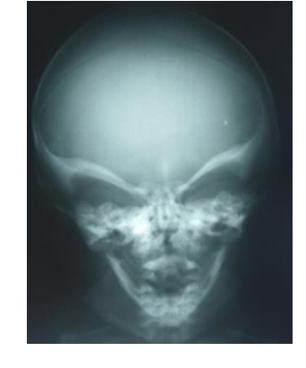
Fig. 2. X-ray report