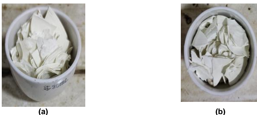
Fig. 2. Powder resulting from the 8-hour calcination of batik shellfish shells. (a) At a temperature of 800°C. (b) At a temperature of 900°C

From Table 1, the average efficiency of CaO compound resulting from the calcination of batik shellfish shells at 800°C is 61.85%. Meanwhile, from Table 2, it can be observed that the average efficiency of CaO compound resulting from the calcination of batik shellfish shells at 900°C is 55.64%. Comparing the average efficiency of CaO compound resulting from calcination at 800°C and 900°C, it can be seen that the average efficiency of CaO compound obtained at a calcination temperature of 800°C is higher than that obtained at a calcination temperature of 900°C. This is because the higher the temperature, the purer the CaO compound produced.