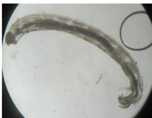
B. Nais communis