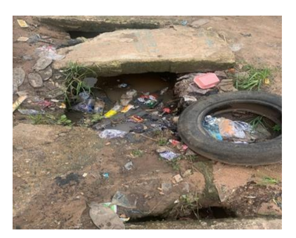
Station 2. Plastic polluted