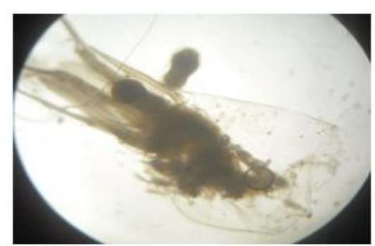
D. Desmocaris bilineata

Plate 1. Representatives of microplastics in the freshwater aquatic insects in the two sampled stations in Delta State