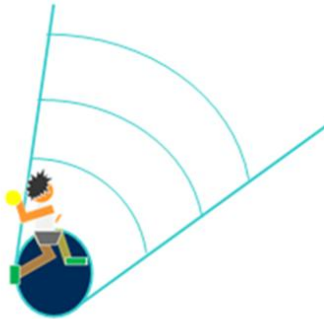
Fig. 3. Measurement of throwing