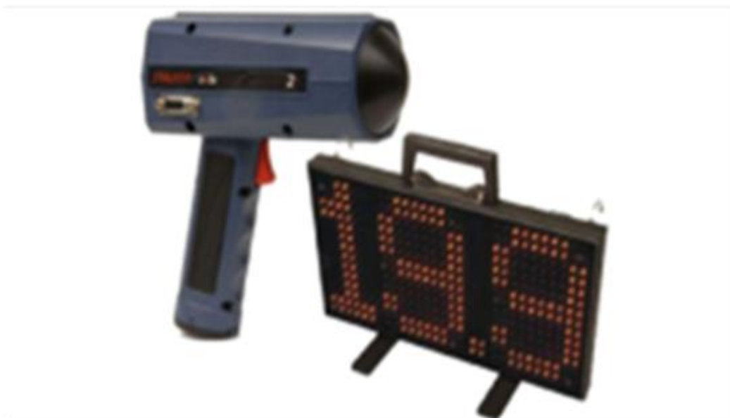
Fig. 2. Doppler radar speed gun (STALKER SOLO2) and LED display