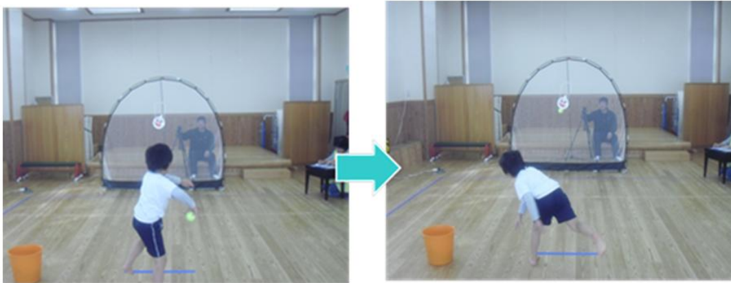
Fig. 1. Measurement of throwing velocity

Throwing distance was measured on a playground. Subjects were instructed to throw a tennis ball as far forward as possible, in 60-degree range from 1 m-diameter circle. All subjects threw twice, and the higher value was considered representative.