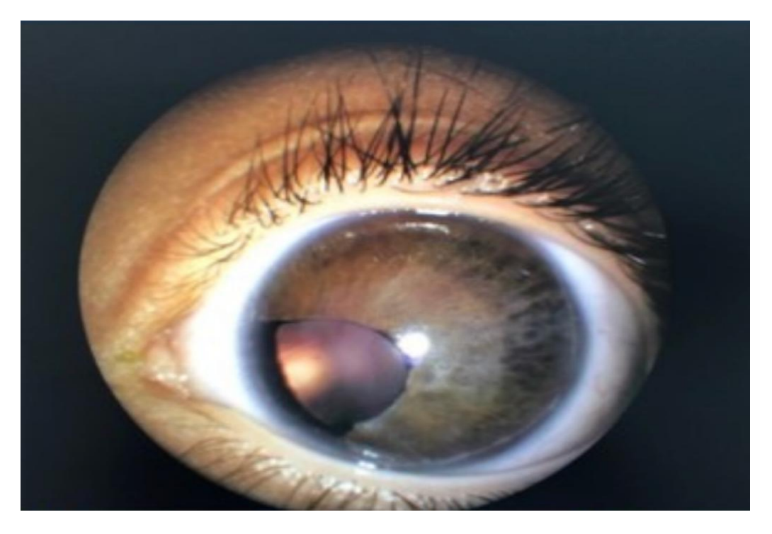
Fig. 2. Biomicroscopy showed an increase in corneal diameter