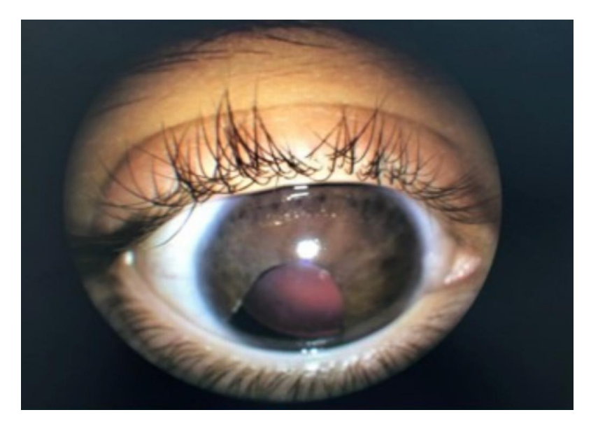
Fig. 1. Biomicroscopy showed an increase in corneal diameter

The patient remains under regular follow-up to control IOP and preserve the nerve fiber layer.