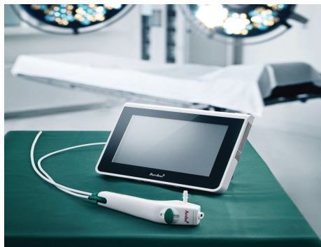
FIGURE 2: The aScope-2 with a transportable monitor.